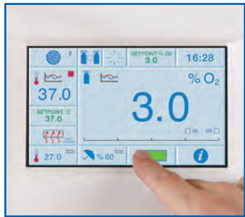
Intuitive operational software accessed via a full colour touch screen interface