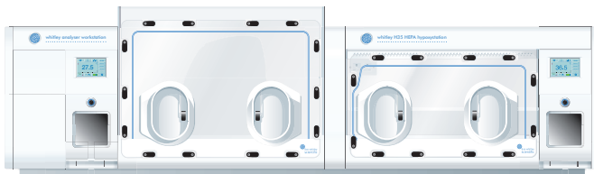
Whitley i2 Instrument Workstation connected to a Whitley H35 HEPA Hypoxystation