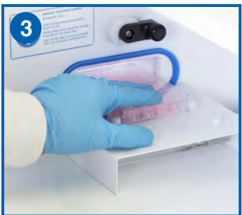
insert cellware into the tunnel. Close and seal the door.