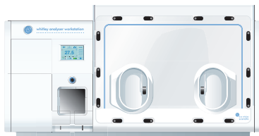
Whitley i2 Instrument Workstation

The i2 Instrument Workstation has been designed specifically for use with Seahorse XF Analysers - The integral 12 litre, rapid-cycle airlock has the capacity to introduce up to 44 x 96 well plates or small items of equipment into the workstation in 60 seconds. An optional letterbox can be specified, ideal for quickly transferring all sizes of dishes and small items.