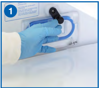
To use the Transfer Tunnel: open the hinged door in the Hypoxystation.