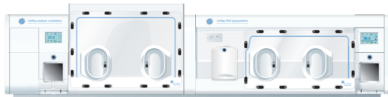
Whitley i2 Instrument Workstation connected to a Whitley H45 HEPA Hypoxystation