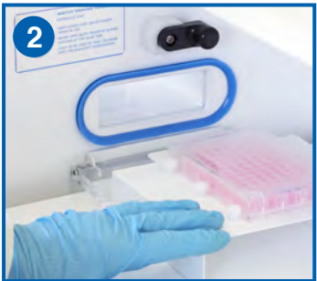
Place the cellware to be transferred on a holder in the Hypoxystation.