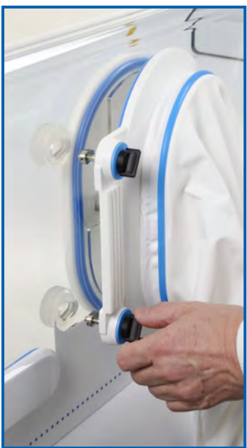
Patented oval ports for ease of movement. Designed to ensure maximum comfort when working in the chamber for long periods.