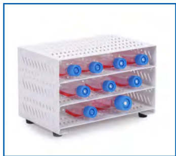
Storage Rack for tissue culture flasks, multi-well plates and other labware.