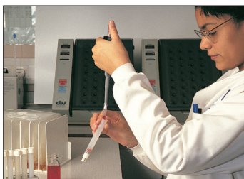
2. One step sample inoculation