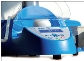
1. Sample preparation