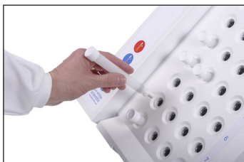
3. Place in RABIT